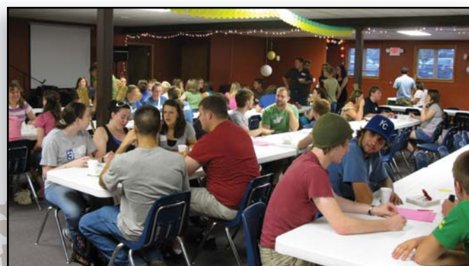
Students using the new lounge, an integral part of the new building, during our fall semester Bash Week

Thank you for your prayers, your financial support, your notes of encouragement... and for being a friend of our ministry.